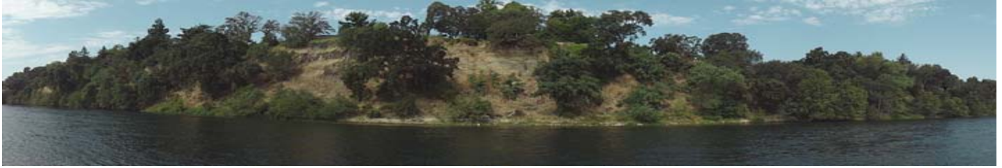
North bank American River upstream of Ancil Hoffman Park and just downstream of the proposed river crossing.

The primary project elements include the following