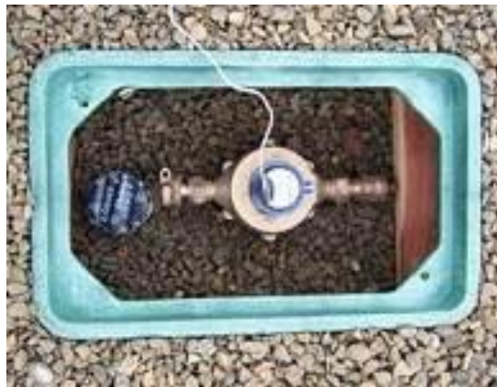
Meter Located Inside Box