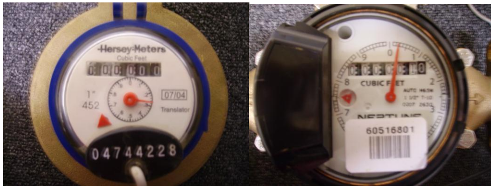
6 Digit Meter

Reading your water meter is similar to reading the odometer in your car. Read all the numbers from left to right. Do not include the numbers after the decimal point or the numbers with a black background.