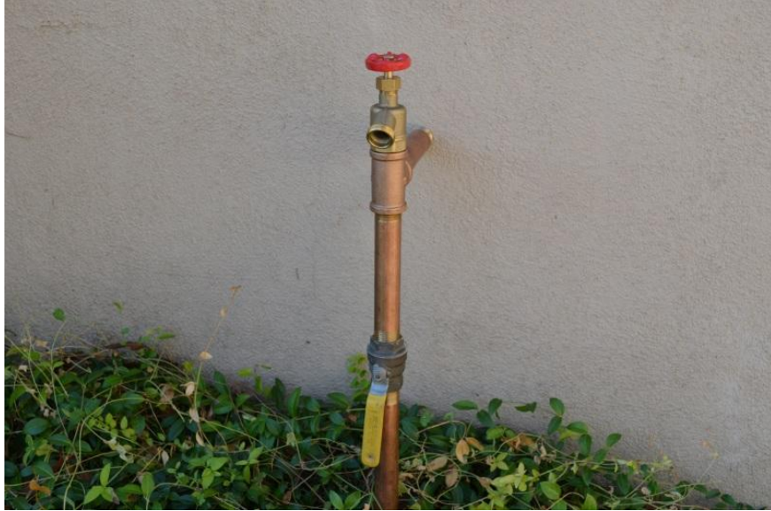
The above photo shows a typical ball valve set up (the valve handle is yellow)