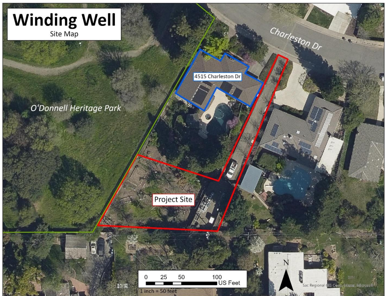
Figure 3-2. Project Site Map